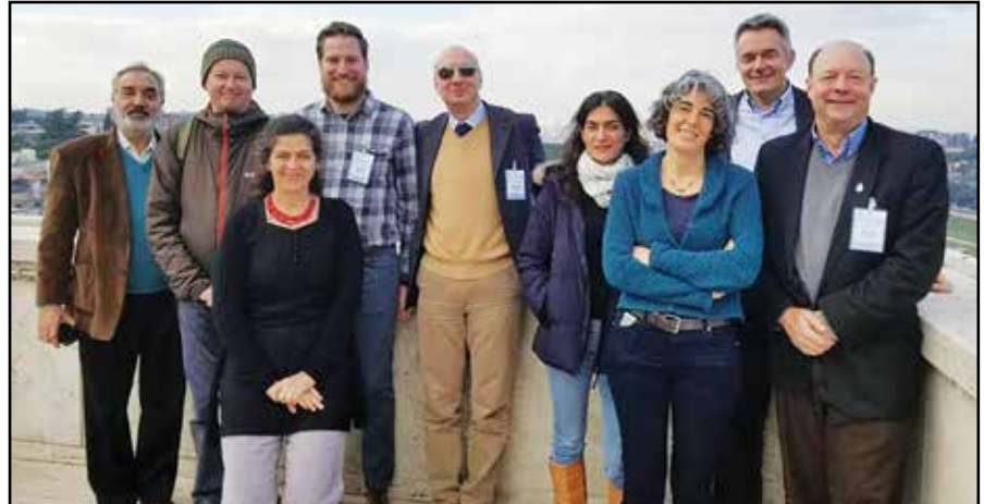
Group of experts who participated in the meeting at FAO Headquarters, December 2017

The white paper on water accounting for water governance and sustainable development recently launched in Brasilia (WWF8, 21 March 2018) makes the case for a systematic adoption of water accounting to address today problems and adapt to tomorrow problem. It states ‘we cannot plan and manage what we do not measure’ and that water accounting is an essential step for water governance reform. Many reasons are being advocated to justify why water accounting is needed, what benefits it brings and how it could support sustainable development. However, the global review done to prepare this white paper— literature review, online discussion— reveals that there is still very limited use of ‘water accounting’ around the world and when it is used, it is often done as part of a project, a research. Rare are the cases, where it’s use is institutionalized, for example, in Australia that uses national water account for water allocation between sectors, among other uses. Additionally, the white paper insists that you do not need to measure everything and that even if you cannot measure, you can accept a