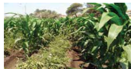
Maize intercropped with tomato

The prevailing rotation in salt affected soil is characterized by intensive rice cultivation to leach salts away from root zone. However, rice cultivation after wheat and rice cultivation after sugar beet are exhausting to the soil. Thus, in the proposed rotation, short season clover was planted after summer crop and before winter crop to improve soil fertility. Through this rotation a saving of 3426 m 3 /ha was achieved.