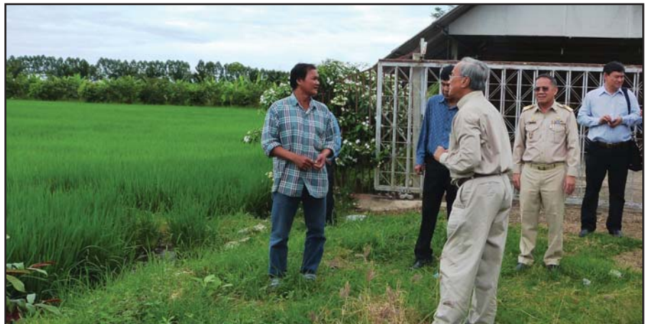
Officials from the Ministry of Agriculture and Agricultural Cooperatives visiting farmer's field

The objectives of the Thai Government's New Rice Farming System Project are