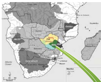
River basins of Zimbabwe

Groundwater resources are mainly used for potable water supplies in rural areas. There are two major aquifers in Zimbabwe viz., the Nyamandlovu aquifer and the Lomagundi aquifer, where large-scale commercial farms use the water mainly by sprinkler irrigation systems. The Nyamandlovu aquifer also augments the municipal water supply for Bulawayo and there is a need for fair and equitable access to the water resources. Alluvial aquifers that represent the overlap of surface