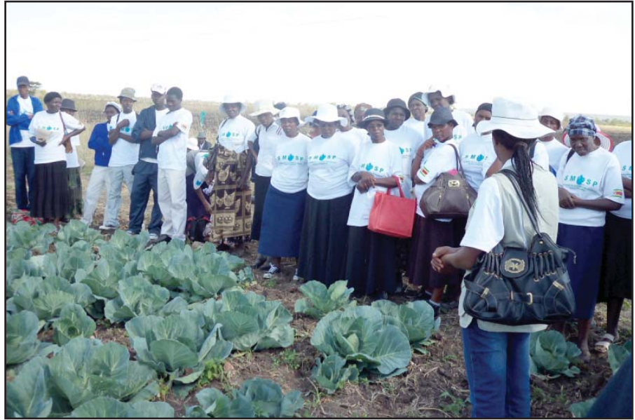
Eluhlaza farmers at redwood cabbage field

The increase in the availability of nutritious food in rural areas is attainable through smallholder irrigation schemes that receive support mainly from the government and development partners. It is the mandate of the government to ensure national food security and the ZwCID is committed