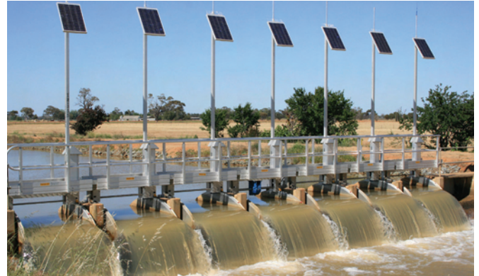
AUTOMATIC FLOW REGULATING GATES

Water savings generated by the NVIRP project are in turn being independently audited in conformance with a Technical Manual which itself has established world's best practice in terms of providing a methodology for reliably quantifying water savings as a result of specific works and measures. Management Authority to support other water savings projects such as on-farm efficiency programs which leverage off the benefits of a modernized distribution system. It is expected that Irrigation modernization works over the ten year program will reduce system water losses and generate