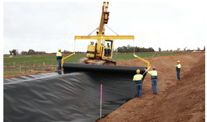
PLASTIC LINING (HDPE) OF A CANAL

savings to benefit both the environment and consumptive water users.