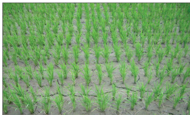
A PRACTICAL WAY TO IMPLEMENT CONTROLLED IRRIGATION IS TO OBSERVE THE COMPACTION LEVEL AND THE FIELD CRACKS

and autonomous regions providing significant economic and social benefits.